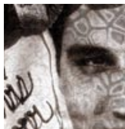
"Maori Elvis" (detail)

While "Duck-a-Lisa" and another of the exhibit's works, "Maori Elvis" with his facial tattoos, are whimsical, others of the group's images are more serious and evocative.